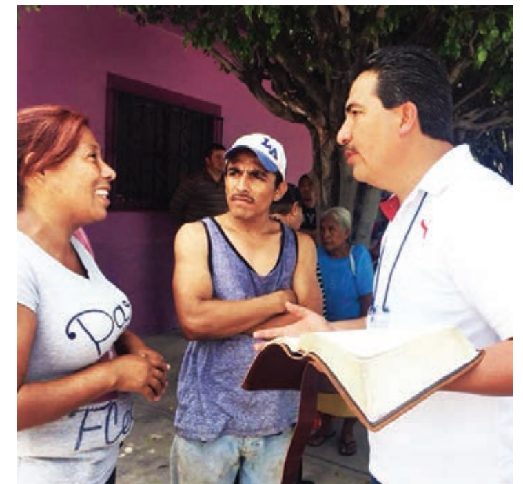
OPPOSITE PAGE: Mexico City's community received food bags from the local church with the help of Children's Hunger Fund. ABOVE: In time of need, local pastors delivered hope through the gospel.