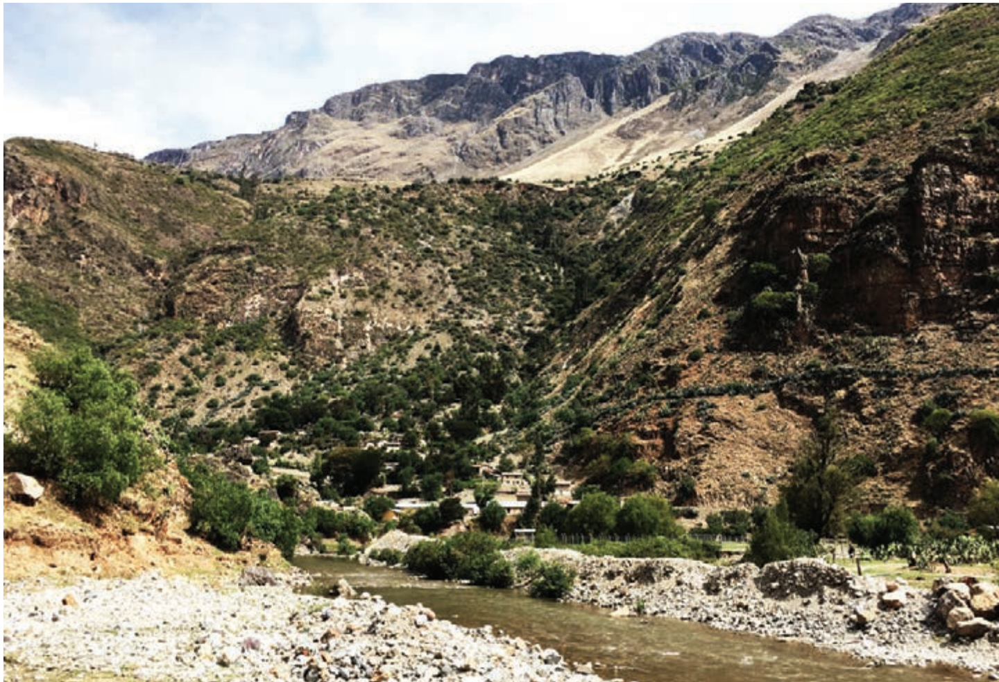
TOP: The remote mountains and harsh terrain of Abancay, Peru provide limited resources for life. OPPOSITE PAGE: Those in CHF's Peru Mercy Network pray together for provision.

That was until they had Food Paks. For three years, Children's Hunger Fund has worked with ministry partners in Peru to share school supplies, blankets, and food as a means of providing hope. These resources have created opportunities to start relationships, and to share the Word of God. Children's Hunger Fund will continue to partner with those who are serving in these remote villages for the glory of God's gospel.