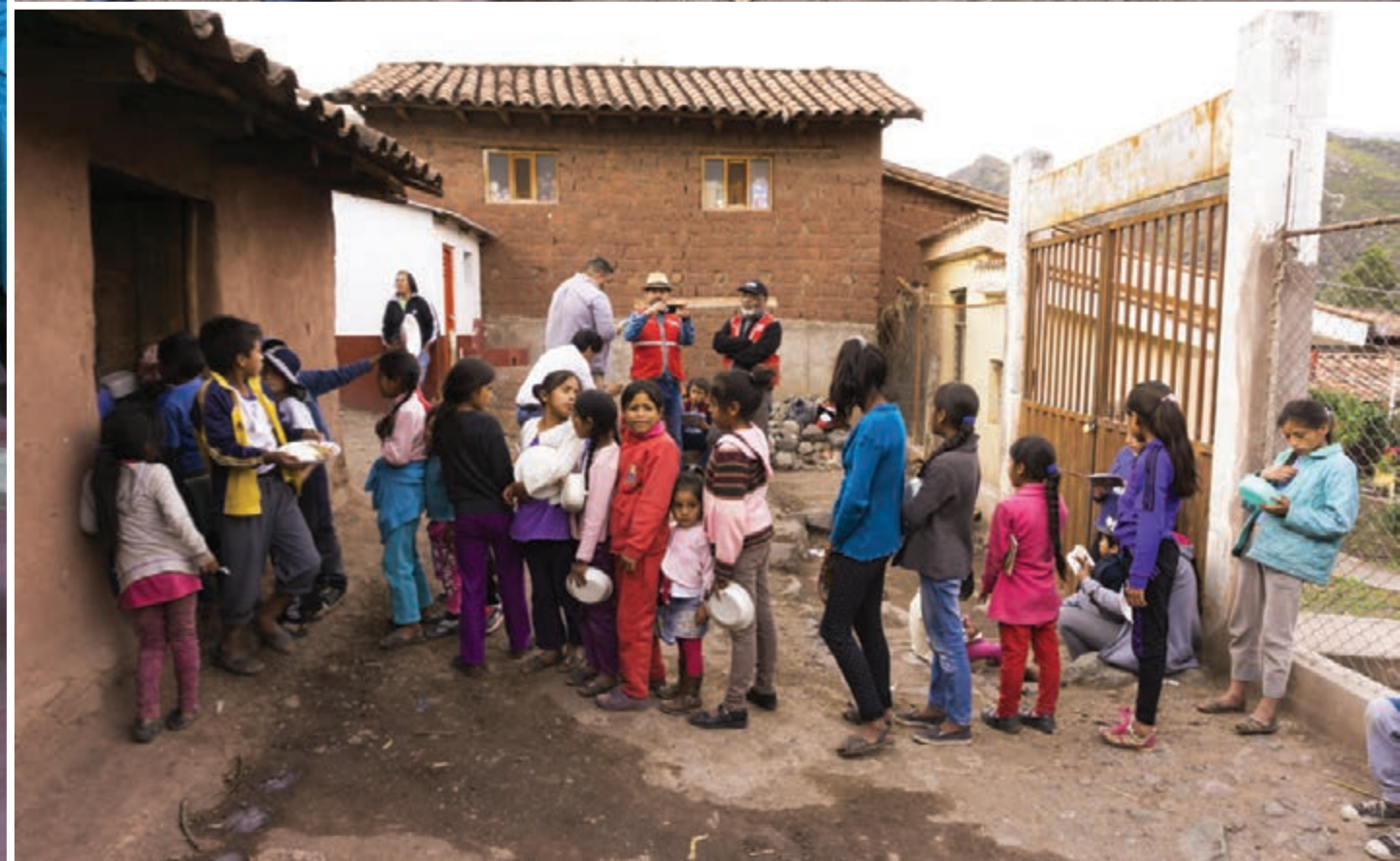
THIS PAGE - TOP: The church in Abancay, Peru provides hope and meals to families in the community. THIS PAGE - BOTTOM: Children in Abancay wait in line at a local feeding center to receive food from Children’s Hunger Fund. OPPOSITE PAGE: The people of Abancay pray and worship in their local church.