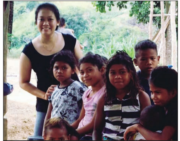
WOMEN'S MINISTRY AND CROSS-CULTURAL MISSIONS