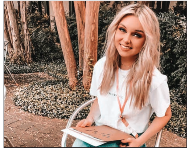
LICENSED CHRISTIAN COUNSELOR