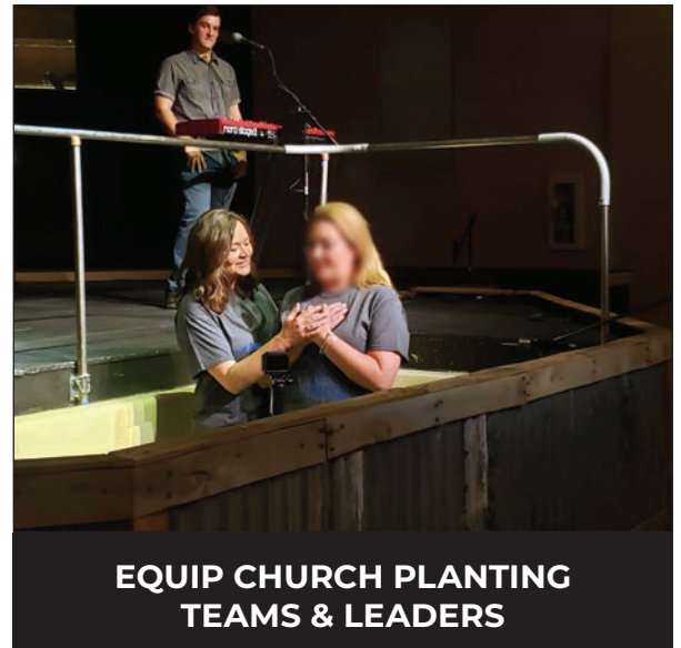
EQUIP CHURCH PLANTING TEAMS & LEADERS