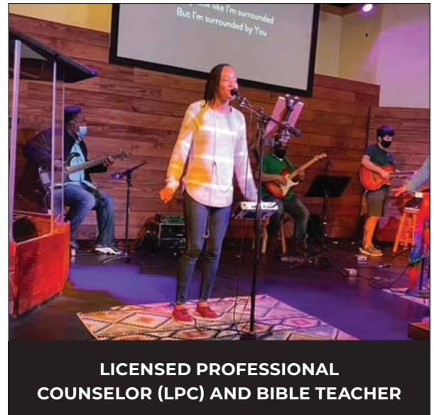
LICENSED PROFESSIONAL COUNSELOR (LPC) AND BIBLE TEACHER